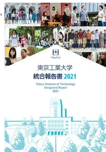
Front cover of Tokyo Institute of Technology Integrated Report 2021

As it prepares for its 150th anniversary in 2031, Tokyo Tech formulated its Action Package, a guide that aims to bring about a prosperous future society and sustainable development for the Institute and the world through co-creation with society as Team Tokyo Tech. The Action Package, which is based on Tokyo Tech's desired future direction, includes ambitious and challenging initiatives that will lead to reforms in education, research, and governance, and will be reviewed and implemented on a regular basis.