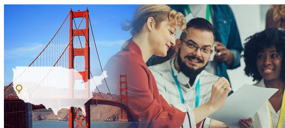
Tokyo Tech ANNEX Berkeley

After the opening of Tokyo Tech ANNEX Bangkok in FY18 and Tokyo Tech ANNEX Aachen in FY19, the Institute opened its third overseas base for international collaboration, Tokyo Tech ANNEX Berkeley, in Berkeley, California in October. Opportunities for collaboration and the creation of joint research topics were sought through research showcases and workshops at these ANNEXes. The opening of the third Tokyo Tech ANNEX further strengthens the Institute's international communications and enhances the global reputation of Tokyo Tech.