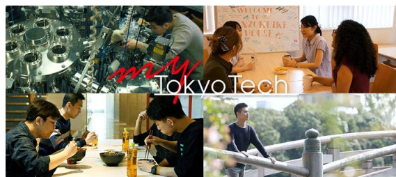
My Tokyo Tech video series

Tokyo Tech's website for prospective students was fully renewed to improve access to information regarding education at the Institute. My Tokyo Tech, an English video series featuring current international students who talk about various topics such as research, dorm and student life, and the highlights of their stay in Japan, was also launched on the Tokyo Tech YouTube channel and Discover Tokyo Tech, an English website aimed at prospective international students. The series currently contains seven videos, all created with the student's perspective in mind. The Institute will continue to launch videos that provide inside views into the current life of Tokyo Tech students.