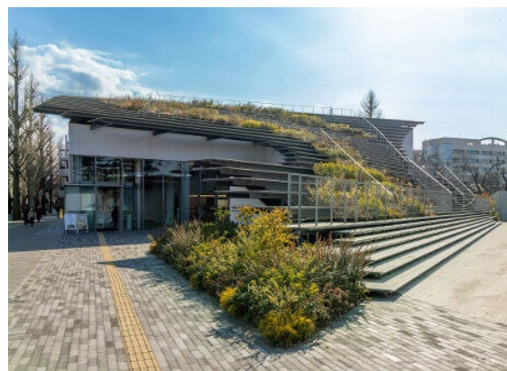
Hisao & Hiroko Taki Plaza

Tokyo Tech's International Student Support desk moved to Hisao & Hiroko Taki Plaza, the new student exchange hub, and now offers counseling services in Japanese, English, and Chinese. At the new global lounge, students can watch international broadcasts and read international magazines. Since the second half of FY21, students have been able to communicate openly in various languages at the new multilingual chat room, creating additional opportunities for exchange. Cross-cultural exchanges also increased through new events such as the welcome reception for new international students and the English Cafe communication event.